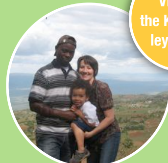
View of the Kerio valley, Kenya

We have several projects in mind to go along with our evangelistic efforts: starting small businesses to create jobs and a "real world" environment for discipleship, using multi-media and video projection to teach about HIV/AIDS (many people still believe it is caused